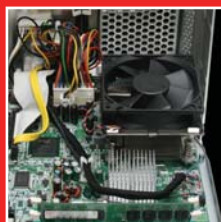
Highest speed processor