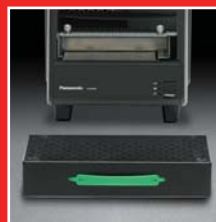
Field replaceable hard drive