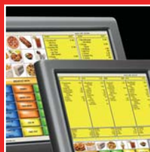
User changeable LCD display